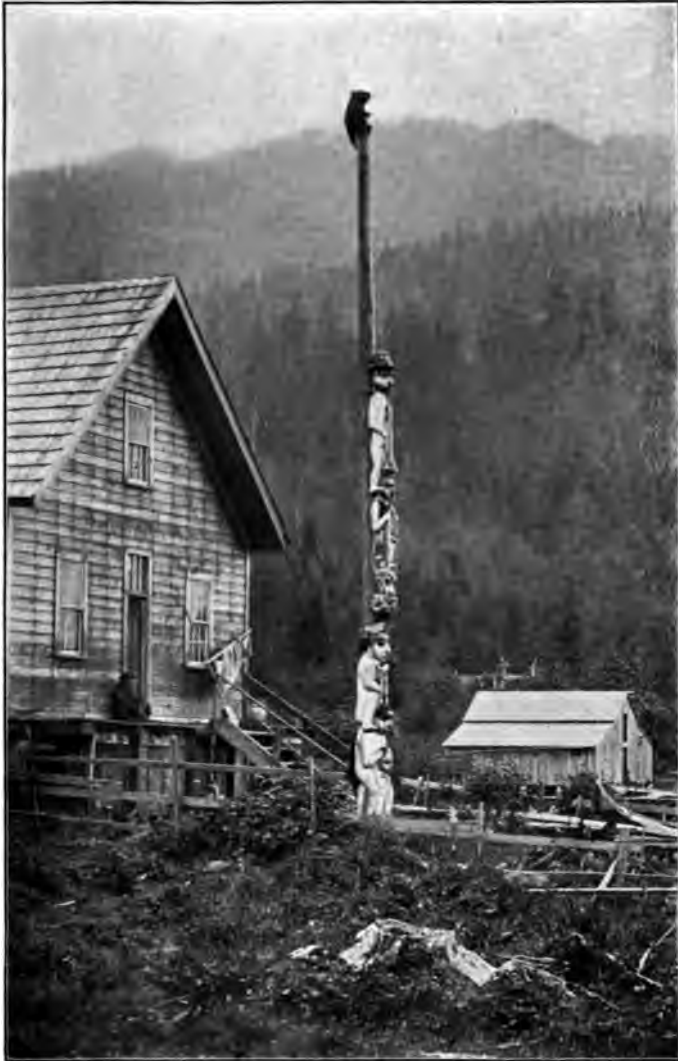
OLD CHIEF AND TOTEM POLE, WRANGELL